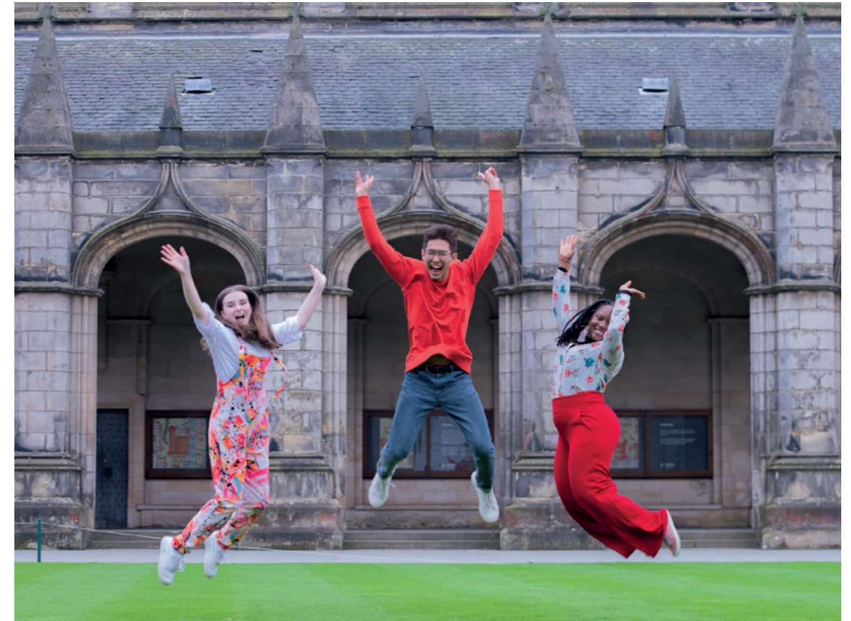
Jumping for joy in the Quad

Thank you - we couldn't do any of this without you.